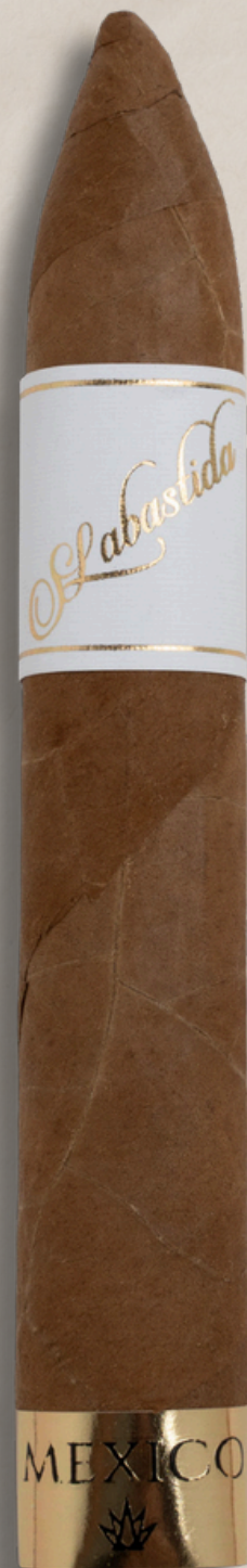
SHORT TORPEDO BOX PRESS 5" X 50