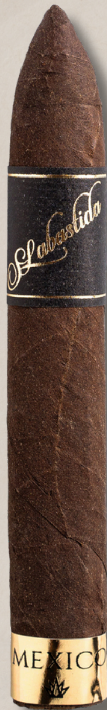
SHORT TORPEDO BOX PRESS 5" X 50