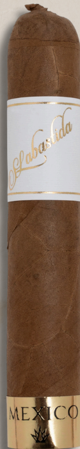
COCHINOS 6" X 60