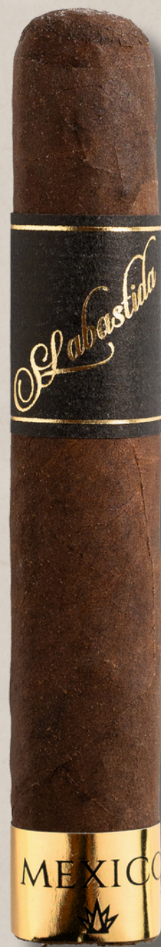
ROBUSTO BOX PRESS 5" X 50