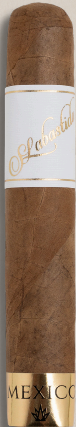
ROBUSTO BOX PRESS 5" X 50