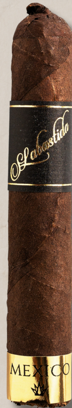
COCHINOS 6" X 60